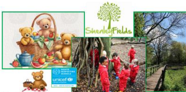
Shenley Fields Daycare and Nursery School Forest school trip to Ley Hill Park for all the family

Forest School offers child led adventures that build confidence, resilience, and emotional strength. Fresh air, freedom, and hands on learning help children feel calmer, happier, and more connected.